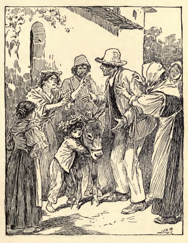
"PICCINO CLUNG TO THE DONKEY, RUBBING HIS CHEEK WOFULLY AGAINST HER GRAY SHOULDER"